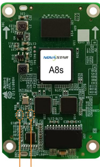
Power Running indicator Indicator